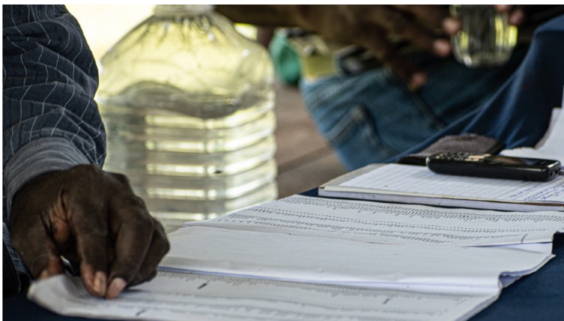
Polling official checking names in the Voter Roll for the PNG 2022 election

on the electoral roll at their polling sites. A clear example can be seen in the East Sepik and Hela provinces, where ballot boxes were destroyed or set on fire because both long-time residents and new voters did not find their names on the electoral roll. 4