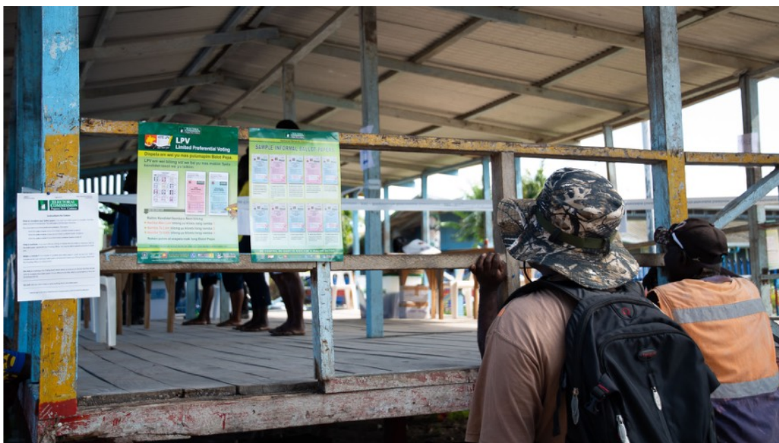
Voting instructions displayed at a polling place during the 2022 PNG election

The PNG Electoral Commission website, the main official source of information about elections, was back online only at the end of May 2022, after the election campaign had already started. Only then were efforts made to post election information for public consumption. Despite this, the website was not consistently online and crashed frequently in the following days, before it was readily available at all times.