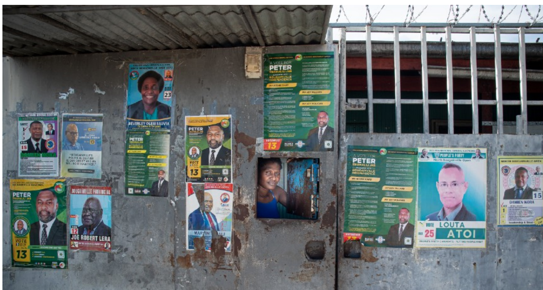
Election campaign posters for the 2022 PNG election, Bougainville

Information relating to election finance is among the most difficult to obtain, even from previous elections, and what information that can be obtained is very brief. Information on campaign budget and expenditure is not available and will not be available until after the election period has ended. In the last election, campaign finance information was released after the election and was summarized in a one-page table released in .pdf format.