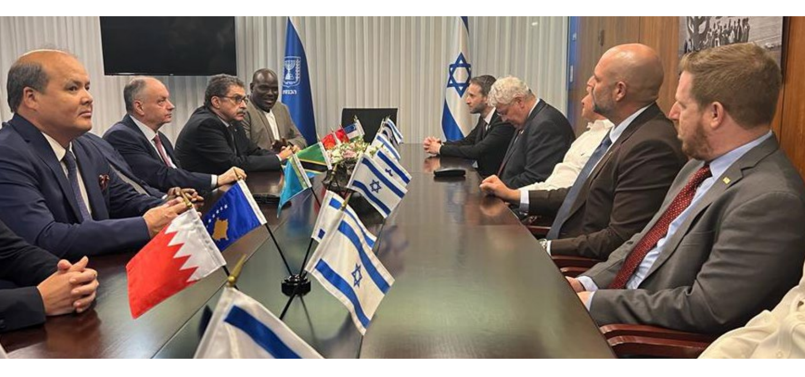
Speaker Amir Ohana of the Israeli Knesset hosted representatives of countries with Muslim populations for an Iftar meal during Ramadan, 2023.

In the Parliament of Egypt, working hours are generally shorter during the month of Ramadan so that Muslim members are able to break their fast with the iftar meal. This is not a rule but a general courtesy that is observed when possible. In Egypt, it is estimated that 90% of the population is Muslim (majority Sunni) and 10% is Christian. The biggest Christian group is the Coptic Orthodox Church, which constitutes about 90% of the Christian community.<sup>115</sup> While the Coptic Orthodox Christmas, which is celebrated on 7 January – following the Julian calendar –, is a public holiday, parliament also observes the tradition of not holding any sessions on 25 December, the Christmas Day observed by Western churches (following the Gregorian calendar).