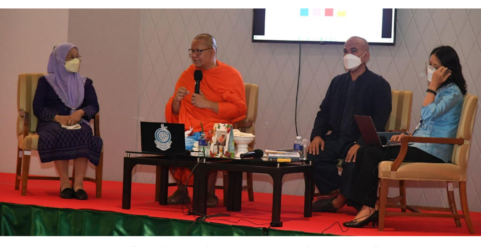
A seminar for parliamentary staff on interfaith dialogue, featuring panellists representing Buddhism, Islam and Christianity (March 2022).

The Constitution of Guyana stipulates the requirement to have an Ethnic Relations Commission. The commission comprises representatives of religious bodies, the labour movement, the private sector, youth and women. Nominated members require a two-thirds majority of parliament to be selected. One of the mandates of this committee is to "encourage and create respect for religious, cultural and other forms of diversity in a plural society."<sup>51</sup> It organizes activities to promote social cohesion, reviews legislation, makes recommendations to the National Assembly and investigates allegations of discrimination. It submits a yearly report to the Speaker of the National Assembly on its activities as well as ad hoc reports on matters of importance.<sup>52</sup>