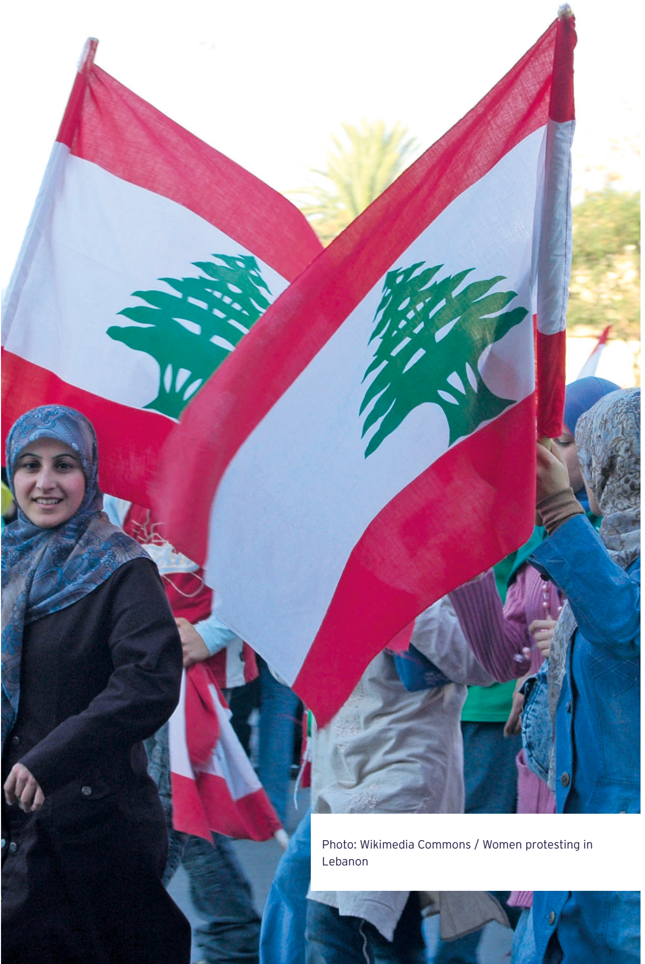
Women protesting in Lebanon