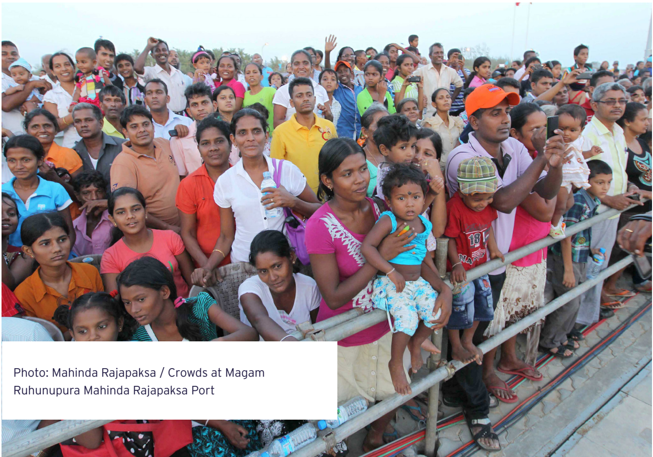
Crowds at Magam Ruhunupura Mahinda Rajapaksa Port

As predicted by economic feasibility studies, Hambantota Port did not thrive financially, causing Sri Lanka's government to seek out additional loans. In December 2018, under mounting financial pressures and continued losses from the port, Sri Lanka agreed to hand over 85% equity of the port to China Merchants Port, a preferred company of the Chinese government. In addition, China Merchants Port negotiated the ownership of 15,000 acres of land around the port.