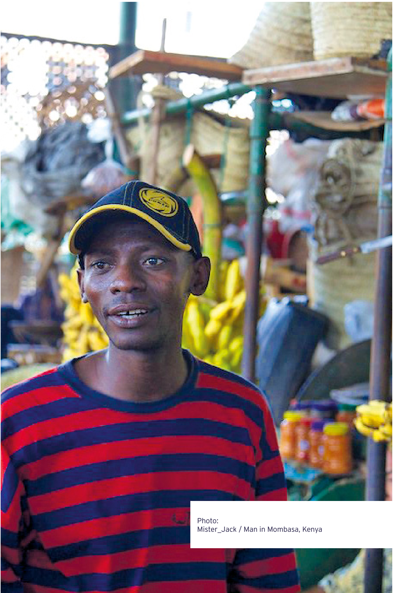
Man in Mombasa, Kenya