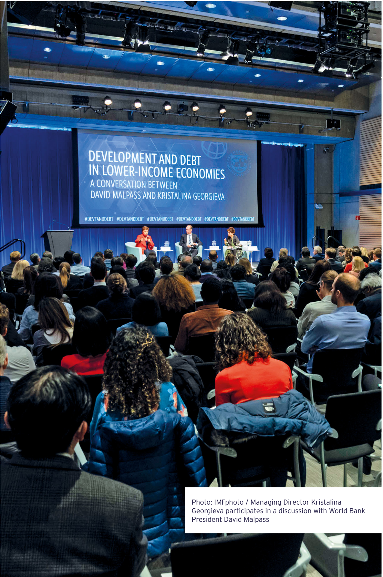
Managing Director Kristalina Georgieva participates in a discussion with World Bank President David Malpass