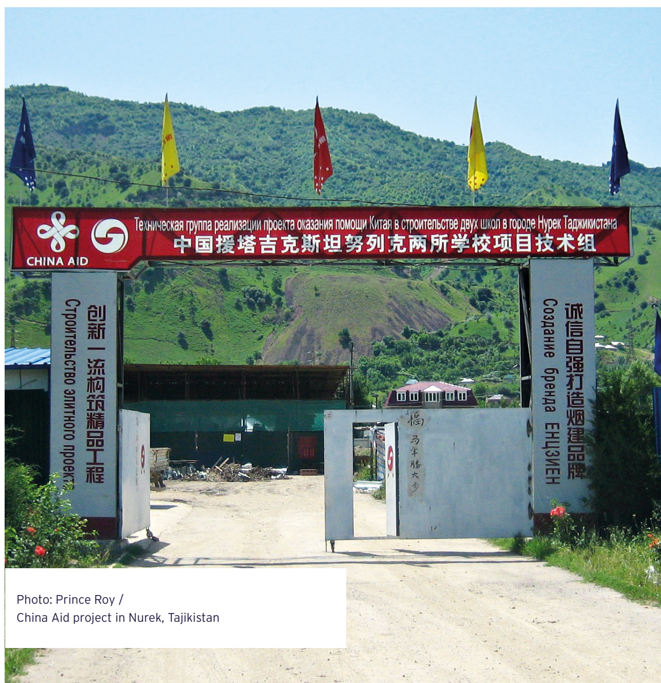
China Aid project in Nurek, Tajikistan

Contingent liabilities refer to "obligations whose timing and magnitude depend on the occurrence of some uncertain future event outside the control of the government". 55 Contingent liabilities include lines of credit, letters of credit, and loan commitments. 56 In that respect they are 'off-balance sheet', because they are not recognized as part of the debt until they are called. Contingent liabilities are only paid when an unexpected event occurs. Most governments include a line item for contingencies in their budgets. This is where contingent liabilities should be paid.