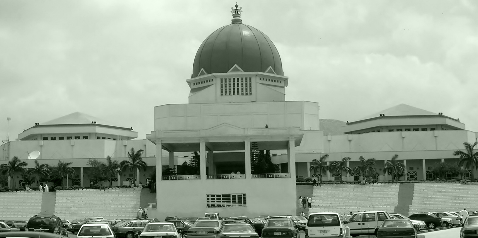
Nigeria's National Assembly