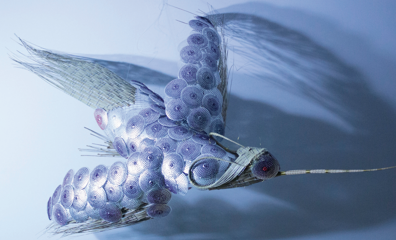
“Water Go Find Enemy” (above) and “Exit Only No Entry” by Adejoke Tugbiyele