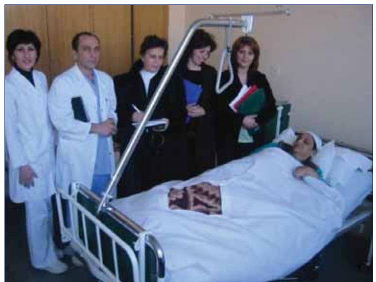
Kosovo: Addressing Health Care Concerns

questions that can be answered without doing any research. While it is easier to carry out casework from a district office, it is certainly not impossible to track constituent requests without one.