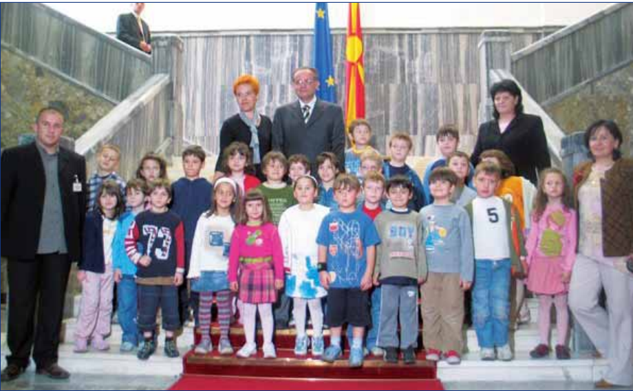
Macedonia: Opening Doors to Youth

In many countries, parliaments have taken the extra step of not only creating open and public processes in how they function, but also opening their doors to the public directly. Some countries have days each year on which the whole of the parliament is open to all, and individuals can wander the halls, sit at committee tables, and experience the parliament. This goes well beyond the standard tour. In Macedonia, for instance, the parliament opened itself to the children of the country, bussing in a number of schoolchildren to the parliament complex for a day of education about the parliament, how it functions, and what parliaments can do for them.