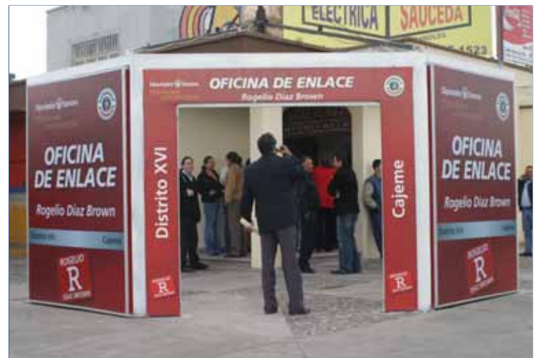
Mexico: Holding Regular Office Hours

Introducing staff into the process frees valuable time for the legislator and affords the staff person a chance to establish the relationship necessary to resolve the problem in the future.