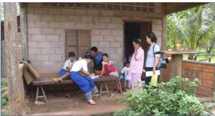
Cambodia: Staying in Touch Through Community Volunteers

After everything that goes into a successful electoral campaign, effective constituent service is critical to success as an elected official. In most jurisdictions, very few citizens