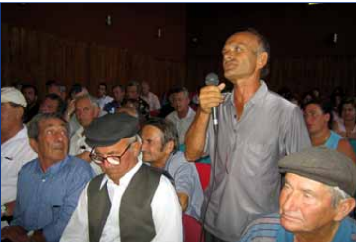
Albania: Reaching Out Through Public Forums

In Albania, legislators use public forums to engage citizens in dialogue about a wide range of issues. In this photo citizens of the Albanian town Novosela query their elected representatives about budget priorities at a public meeting.