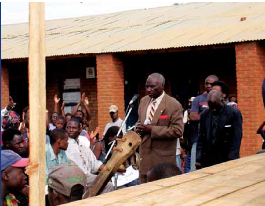
Malawi: Holding Special “Days of Social Encounter”

In Malawi, one legislator holds “Days of Social Encounter” eight times a year in different locations within his constituency. The legislator invites traditional leaders, religious leaders, and the general public for traditional dances, football, food and informal public meetings. This allows the legislator to interact with his constituents in a fun, relaxed context yet still hear the concerns of the people and maintain contact with important local leaders.