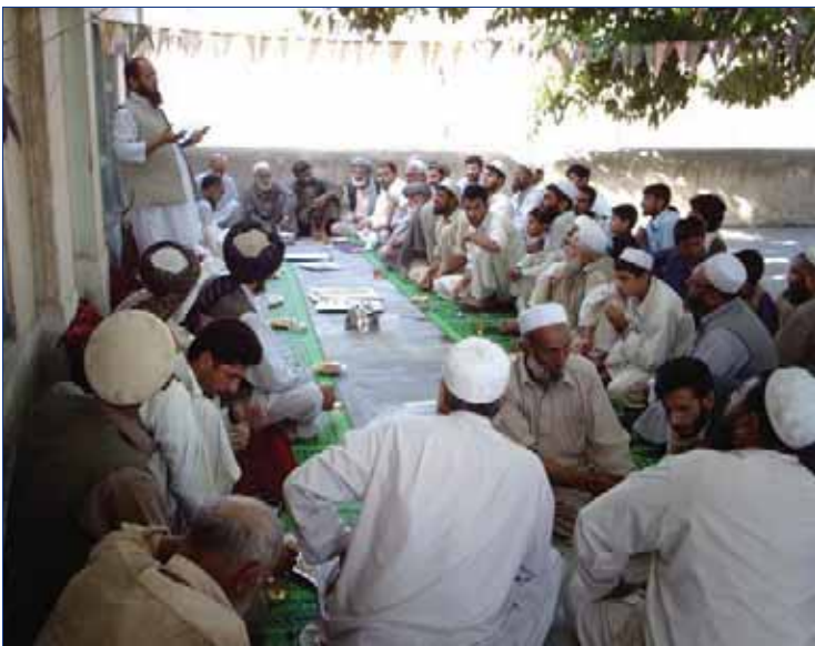
Afghanistan: Discussing Development Needs

Opening Presentation: When giving an opening statement, one should briefly address the topic of the public forum. For example, if a legislator is there to provide an overview of the past session of parliament, he/she may want to limit the discussion to three key issues. This speech should also reflect a well-researched understanding of the topics being presented to the audience. Of course, the type of audience is the real key to the style of presentation. A legislator would not be well served if he/she gave remarks addressing a lawyers association in the same manner as to a group of elderly pensioners. Be prepared to discuss issues; do not simply recycle old campaign rhetoric. A legislator will be more appreciated as a speaker if he or she is clearly prepared to discuss the audience's concerns and speak in a style the audience can relate to and understand.