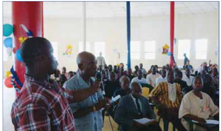
Liberia: Soliciting Support from Local Groups

How many and where? An active representative should develop some type of regular schedule for public meetings throughout the district. The size, the number of constituents they need to meet with, and the geographic features of the district will probably determine this schedule, as well as availability of resources. In many rural areas, the weather and seasonal influences will affect when and how one can travel. When planning these trips, legislators should sit down with staff and review those areas that might be a priority. Is there a place the legislator has never been, a place that is experiencing a great deal of sudden change, or a location that has a lingering condition which might be