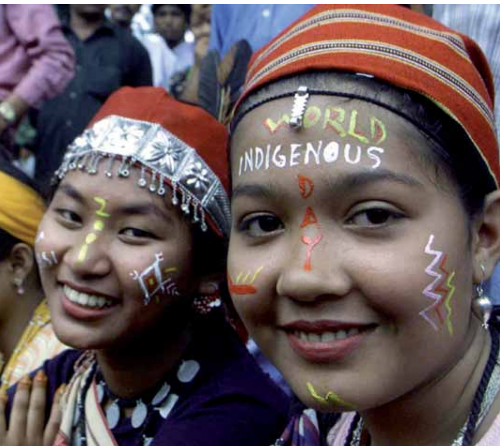
Indigenous women celebrate 'World Indigenous Day' in Bangladesh.