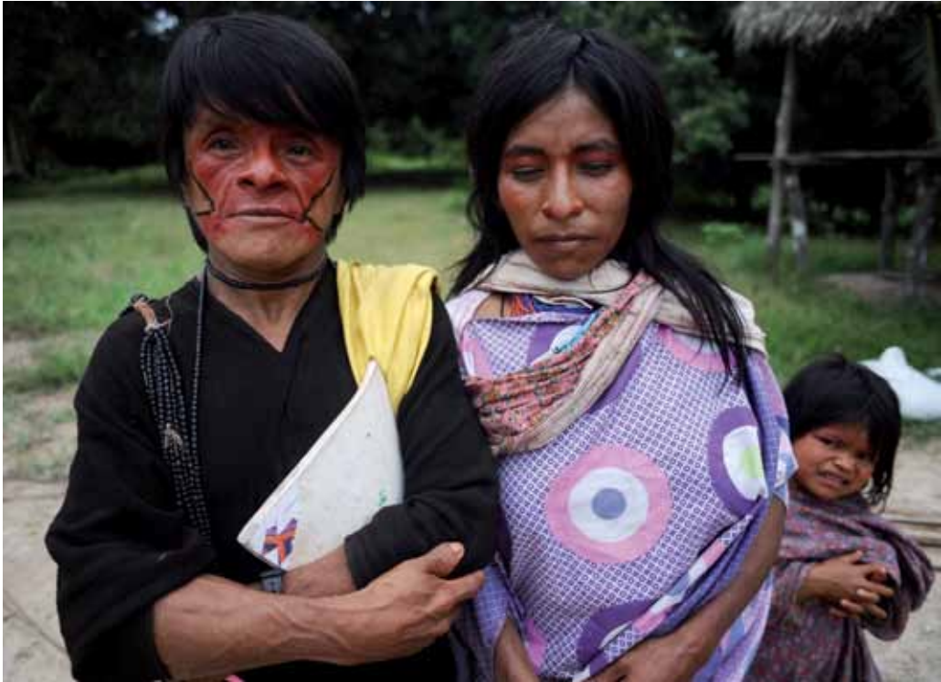
Ashaninka Indians along the Envira River in Brazil's north-western Acre state.