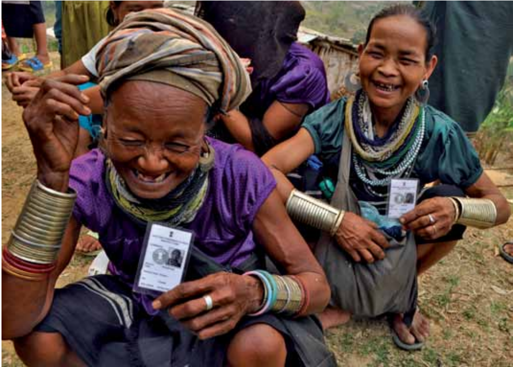
Reang refugees wait to cast their votes at Thamsapara relief camp in the north-eastern Indian state of Tripura.

Rights of Indigenous Peoples refers to participatory rights enshrined in international instruments. 26