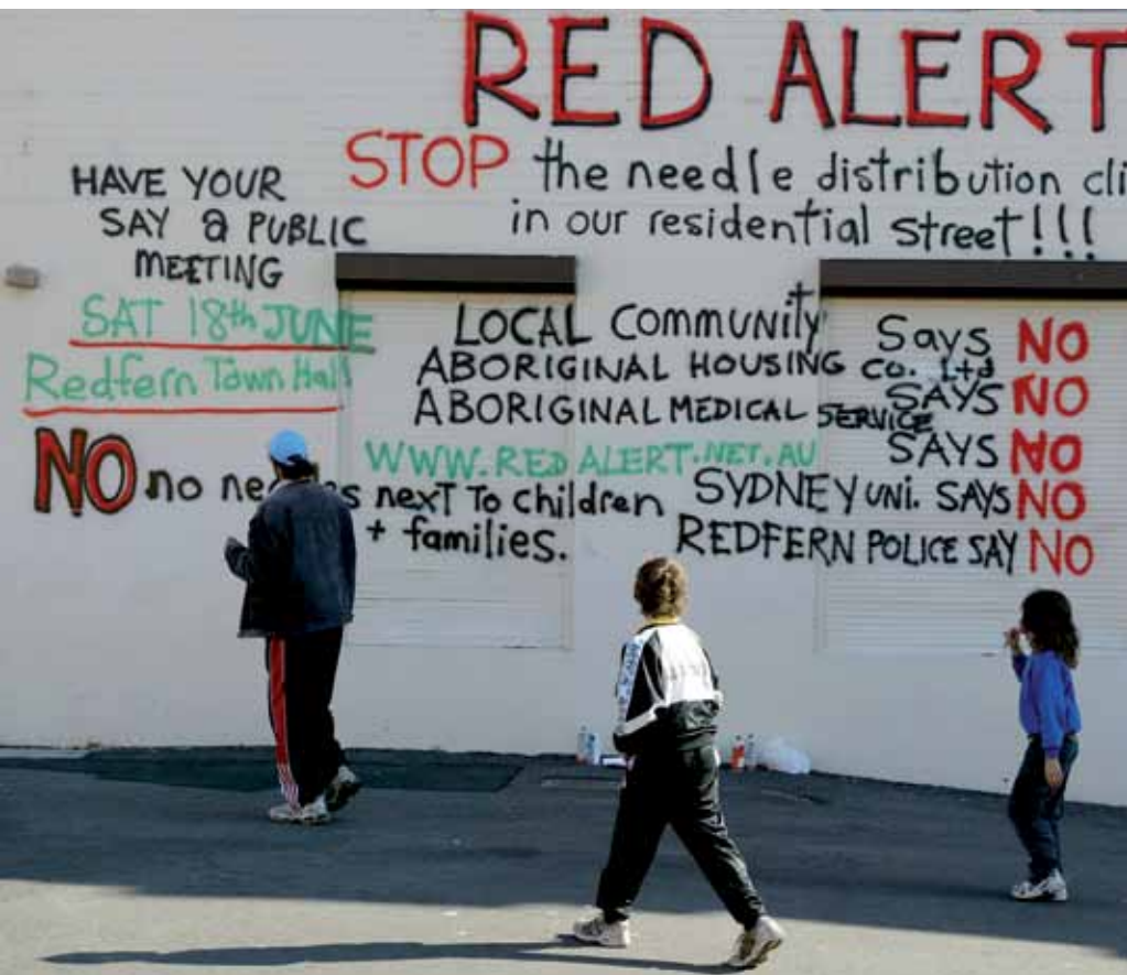
Aboriginal street graffiti in a Sydney suburb is used to communicate community feelings on issues and decisions.

As representatives of the State, all parliamentarians, whether or not their constituency specifically includes indigenous peoples, have a duty to contribute to protecting and promoting the rights of indigenous peoples as enshrined in the UN Declaration.