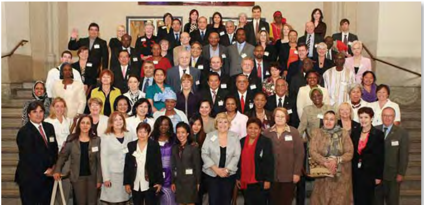
Sixth Annual Global Parliamentarians' Summit group photo

Parliamentarians from around the world convened in Ottawa, Canada on June 10-11, 2010 at the Sixth Annual Global Parliamentarians' Summit to re-examine the role of parliamentarians in achieving the Millennium Development Goals (MDGs). The summit, which took as its theme Balancing the Scales of Women's Lives in the Countdown to 2015 , continued a tradition of parallel parliamentary meetings on international development commitments that have preceded the annual G-8 summits since 2005.