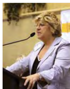
Raymonde Folco, CAPPD Chair

A welcome to all was issued by the Chair of the Summit Steering Committee, Raymonde Folco , MP from Canada and Chair of the Canadian Association of Parliamentarians on Population and Development (CAPPD). She stressed the importance of the Summit in achieving development objectives and invited participants to engage in conversation to prepare a powerful appeal that would voice parliamentarians' concerns on women's and children's health to the leaders of the G-8 countries.