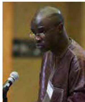
El Hadji Malick Diop

El Hadji Malick Diop , MP from Senegal, observed that no one can foresee the future behaviour of vulnerable populations that can affect the environment and relationships between the North and South. HIV/AIDS, malaria and other diseases develop due to the environment. As each country's economic