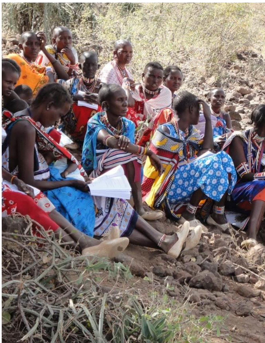
Kenya. Members of Civil society gathered for an Amkeni i Wakenya Forum.

To this end, UNDP implemented a Civil Society Project known as Amkeni Wakenya (a term from the Kenyan National Anthem that calls upon all Kenyans to actively participate in