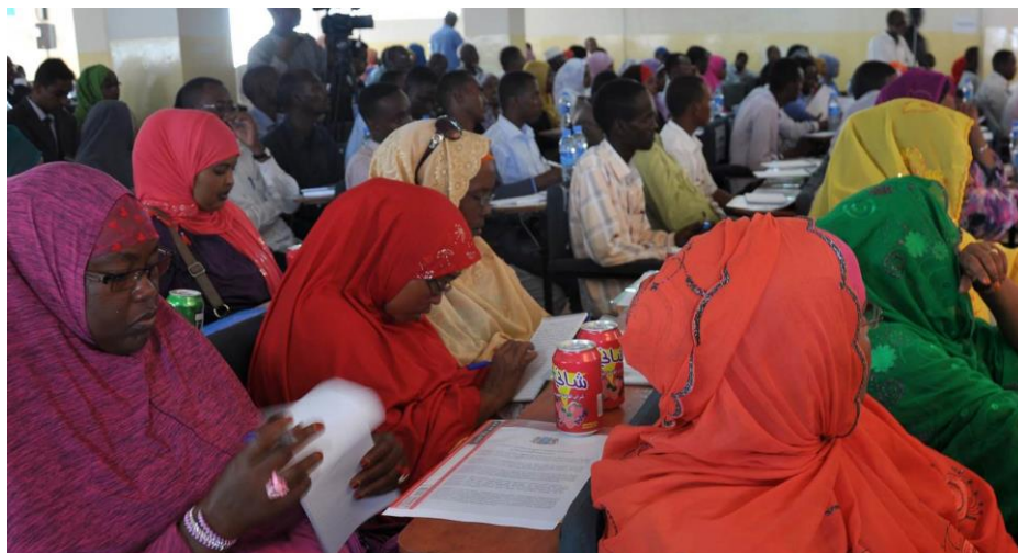
Somalia. Inauguration of the constitutional review process by the Parliament and the Oversight Committee on 16 June 2013.

UNDP is also supporting the NFP to engage in both constitutional review and implementation. To date, this has primarily been done through UNDP's overarching Parliamentary Support Project, which is supporting the new Federal Parliament to establish its institutional capacities to undertake its roles of law-making, oversight and representation. On 16 June 2013, UNDP supported the Parliament Constitutional Oversight Committee to hold its own constitutional launch with members of the civil society, academia, youth and women groups and the media present, sending a strong