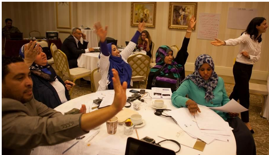
Libya. Trainings of Dialogue Facilitators on Women's Political Participation organized jointly by SCLT and ABC - June and August 2013.

The constitution-making process in Libya will play an important role in