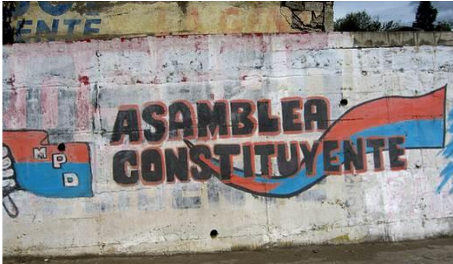
Graffiti for the Constitutional Assembly in Ecuador during the constitutional review process in 2007.

We, the United Nations Department of Political Affairs (DPA) and Department of Peacekeeping Operations (DPKO), the Office of the High Commissioner for Human Rights (OHCHR), the United Nations Development Programme (UNDP), the United Nations Children's Fund (UNICEF), and UN Women are pleased to publish this inaugural issue of "The UN Constitutional."