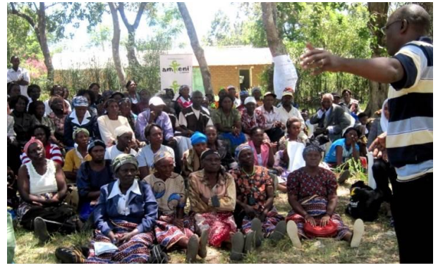
A Civic Education Forum in Machakos Area, Eastern Region of Kenya.

UNDP supported Kenyans to exercise their right to participate in this historic process and the people voted overwhelmingly in favor of a new Constitution. After the promulgation of the new Constitution, Kenyans embarked on the constitutional implementation process. The Government of Kenya in partnership with non-state actors and supported by development partners including UNDP, developed a national programme for civic education known as Kenya National Integrated Civic Education Programme (K-NICE). This was critical to facilitate a fundamental national transformation through policy, legal and institutional reforms which are still underway. The current UNDP K-NICE Programme aims at promoting the collective national aspirations in the constitution, enhancing citizens' participation and promoting responsive governance.