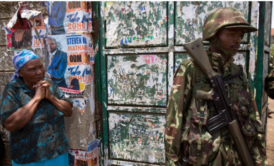
A woman waits outside a tallying centre with a Kenyan police officer guarding the gate at Mathare slum in Nairobi, 6 March 2013.

crowdsourcing experience) to provide women with a stronger platform for identifying and mitigating incidents of violence, such as those witnessed in Haiti after the 2010 earthquake. These tools are being incorporated into efforts to monitor election violence targeting women, a phenomenon frequently invisible to the public as a result of unreported incidents. The crowdsourcing-mapping tool used by Ushahidi to map election-related violence in 2007/2008 in Kenya has been applied for the purposes of early warning in other parts of Africa. In Mali, for example, UN Women has supported its application as part of a "Situation Room" model, also used previously to support women candidates in Senegal and Sierra Leone. The initiative relied upon incident reports collected through text messages and cell phones as well as other ICT tools to provide rapid response to victims. 3